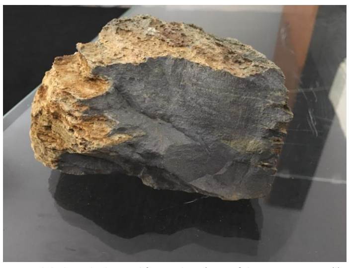
Image 1: Zinc rich massive sulphide rock obtained from Gibson's pit of dimension 14cms (I) x 8cms (d) x 9 cms (h)